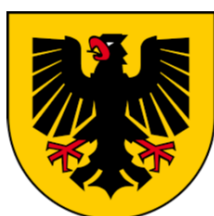
Dortmund (Year 3/4)