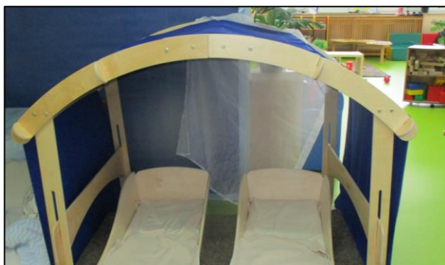
The new sleep pods are a cosy place to nap

Our Nursery currently has spaces available, if you are interested please contact the Main School and book an appointment to visit, the nursery team would love to see you!