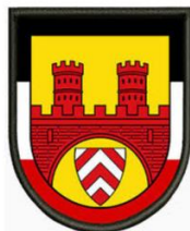
Bielefeld (Year 1)