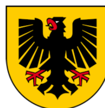
Dortmund (Year ¾)